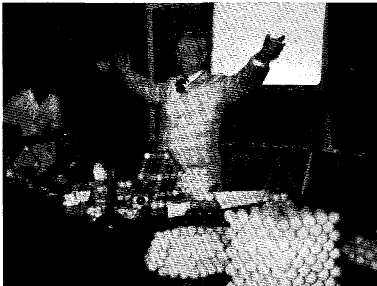
R. BUCKMINSTER FULLER

Both pictures used in this article show Fuller presenting lecture-demonstrations at the Institute Summer Seminar-Workshop in 1950.